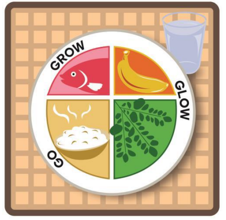
Figure 1. Pinggang Pinoy

Pinggang Pinoy is a food plate guide that will help guide Filipinos on what kinds of food and the recommended proportion consumed per meal. According to the Pinggang Pinoy , one's plate per meal should consist of Go (rice, bread, corn, oats, sweet potatoes, etc.), Grow (fish, egg, legumes, chicken, meat) and Glow foods (vegetables and fruits) in the right portions (See Appendix for portions of food recommended per age or population group). One's plate should look like the image below: